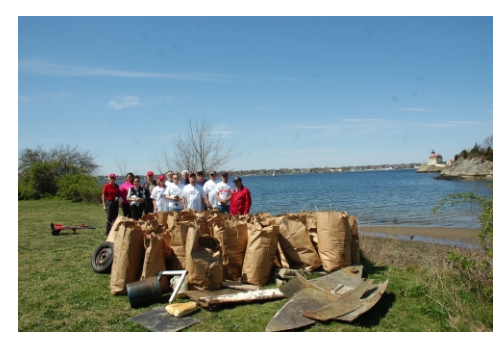
by Carlene Joiner Clean-up crew with trash at Lighthouse Cove

The weather was perfect and the tide at its lowest. Forty bags of trash were collected as well as a number of larger pieces of refuse.