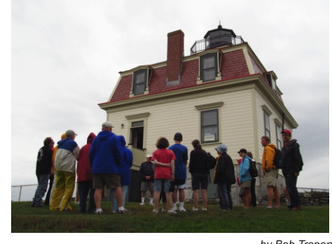
David Kelleher sharing the history of the Lighthouse with members

Once on the island the members were finally able to see the building up close and personal. They were able to go inside so they can see the work that needs to be done and go up to the lantern room and enjoy the panoramic view.