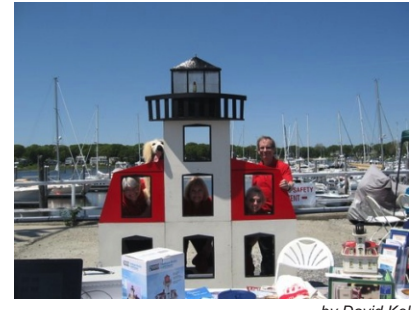
FPRL members plus Keeper at Boat Safety Day

Friends of Pomham Rocks Lighthouse was well represented at the annual Boat Safety Day held at Cove Haven Marina in Barrington on Saturday, May 19<sup>th</sup>. We set up our table with merchandise and informational materials. We also set up our photo op model of the lighthouse for picture taking.